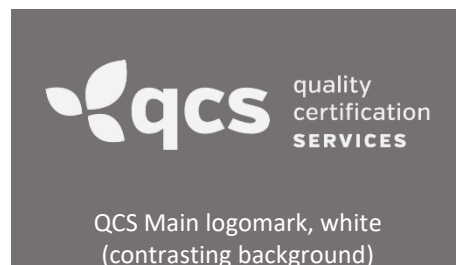
QCS Main logomark, white (contrasting background)

All organic products certified by QCS, both in the NOP and International programs may be identified by one of the official QCS logos. Certified entities receive numbered certificates of certification embossed with the official QCS logo. Logos may appear: