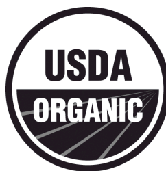
USDA B & W Seal, No Symbol