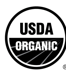
USDA B & W Seal, with Symbol

For labeling and product composition provisions, QCS clients must comply with subpart D Labels, Labeling and Market Information of the USDA AMS Federal Register (7 CFR Part 205) National Organic Program's Final Rule. Subpart D describes the relevant usages of seals per category of certification and organic product compositions. All clients granted QCS organic certification to the USDA NOP regulation receive the privilege to use the USDA and/or QCS seals. Certified operations may use the USDA logo, with or without the registration mark ®, on certified products.