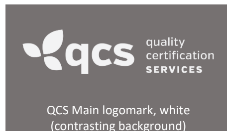
QCS Main logomark, white (contrasting background)

All organic products certified by QCS, both in the NOP and International programs may be identified by one of the official QCS logos. Certified entities receive numbered certificates of certification embossed with the official QCS logo. Logos may appear: