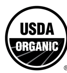
USDA B & W Seal, with Symbol

For labeling and product composition provisions, QCS clients must comply with subpart D Labels, Labeling and Market Information of the USDA AMS Federal Register (7 CFR Part 205) National Organic Program's Final Rule. Subpart D describes the relevant usages of seals per category of certification and organic product compositions. All clients granted QCS organic certification to the USDA NOP regulation receive the privilege to use the USDA and/or QCS seals. Certified operations may use the USDA logo, with or without the registration mark ®, on certified products.