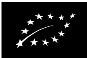
EU Organic Logo, One Color Dark