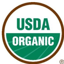
USDA Four Color Seal, with Symbol