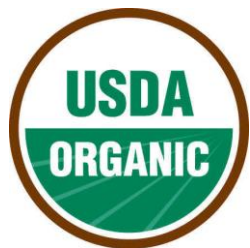
USDA Four Color Seal, No Symbol