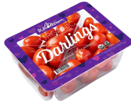
PLASTIC CONTAINERS WITH A FULLY SEALED TOP FILM THAT MUST BE RIPPED OFF TO ACCESS PRODUCT.