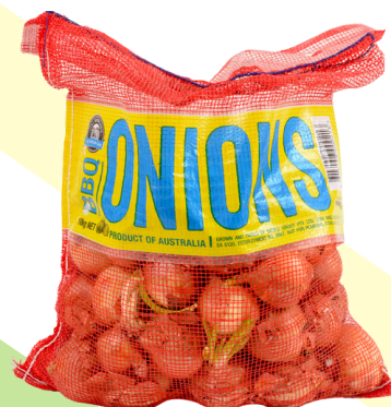
MESH OR PLASTIC PRODUCE BAGS WITH A LABEL/STICKER THAT SEALS THAT BAG OR IS SEWN SHUT