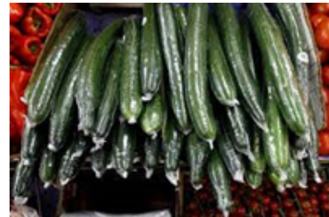
PRODUCE WRAPPED IN PLASTIC WRAP THAT MUST BE RIPPED OFF