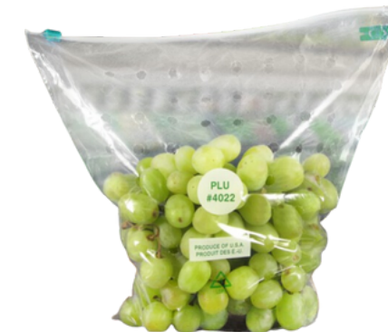
ZIP-TOP PRODUCE BAGS WITHOUT A SEALED TOP OR STICKET