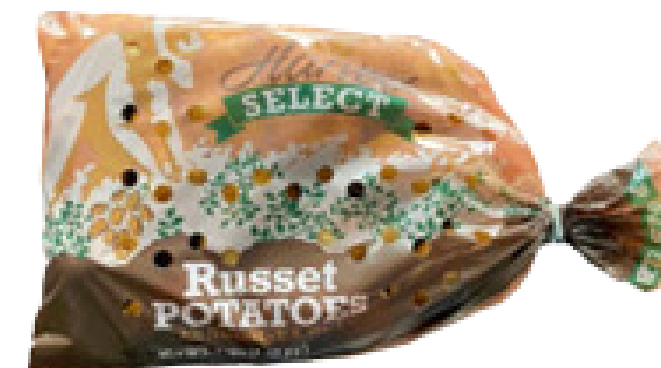
MESH OR PLASTIC BAGS THAT ARE CLOSED WITH A TWIST TIE, STRING, OR A KNOW THAT COULD BE OPENED WITHOUT DAMAGING THE PACKAGING OR LABEL