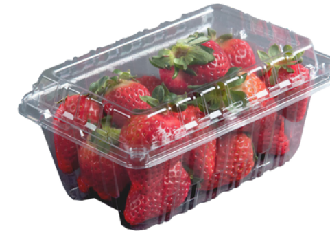
CLAMSHELLS WIHTOUT A STICKER CLOSING THE CLAMSHELL