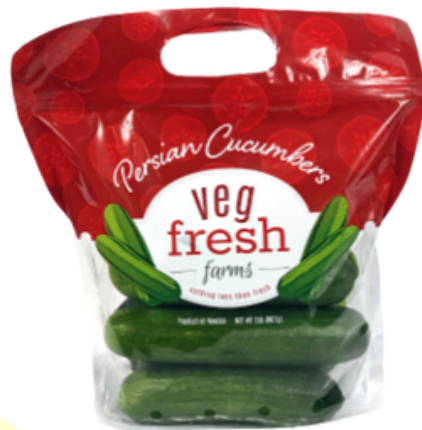
ZIP-TOP PRODUCE BAG OR BOX WITH A SEALED TOP THAT MUST BE RIPPED TO BE OPENED