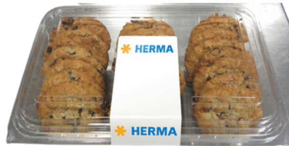
CLAMSHELLS WITH STICKER CLOSING THE CLAMSHELL