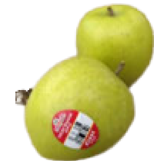
PRODUCE WITH A PLU LABEL NOT WRAPPED IN INDIVIDUAL PACKAING